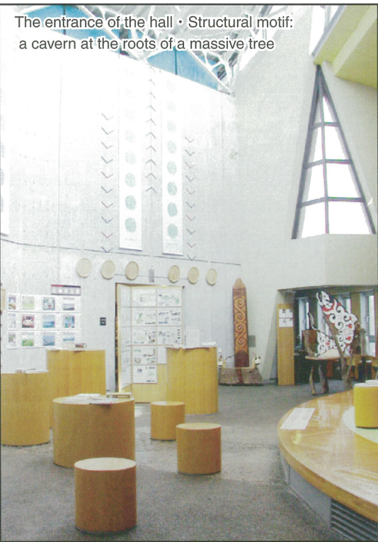
Salon for oral literature The salon is used by guides and for lectures and dancing lessons. It is also used for discussion by visitors who have seen the exhibits.

This is a museum where we must preserve Hokkaido's true history and culture, treasures found nowhere else on Earth. We must enrich this heritage as we pass it down.